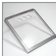
Protective window MLPN 46-00867

For more information: www.honeywell.com/aidc