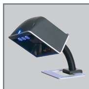
Flex-pole stand MLPN 46-00868