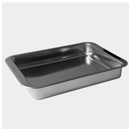
LARGE ITALIAN PLATE