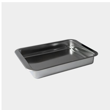
SMALL ITALIAN PLATE