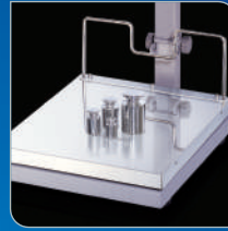
Dual interval technology