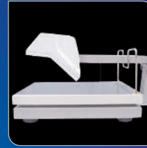
Bendable head bar