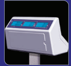
Dual LCD display with backlight